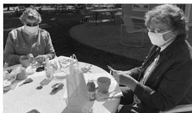
Enjoying the back patio at the Hilltop Center