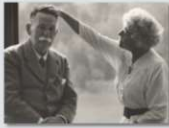
Van Wyck Brooks