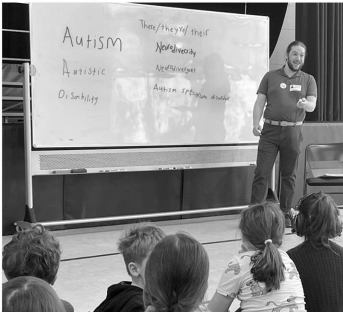
PTO Autism Awareness

Thank you for your continued support! Kindly submitted by, The Burnham School PTO