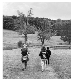
Volksmarsch Walk 2022