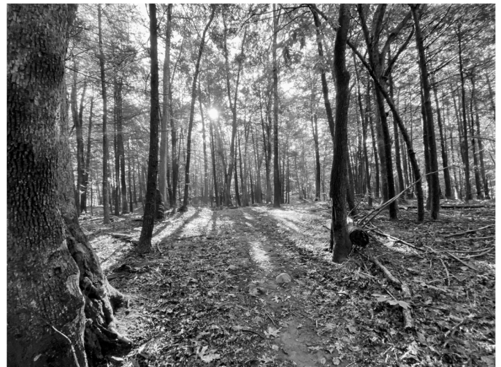
A glimpse of our new Tappen Brook Trail network.