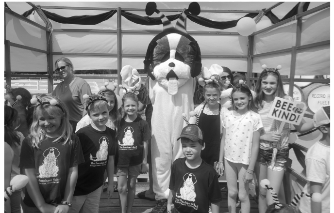
Burnham's 'Bee Kind' float won 'Best Junior Entry' at the Bridgewater Tractor Parade