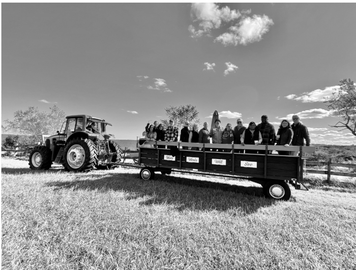
The winners of the "Not Your Grandpa's Hayride" enjoy a perfect fall day.