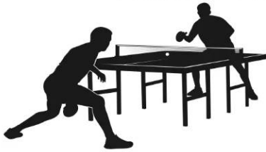
Table Tennis 6:30pm at the Hilltop Center on Mondays starting in February.