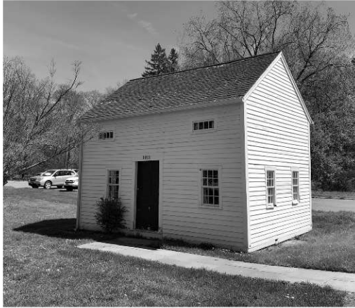
The Captain's House before demolition