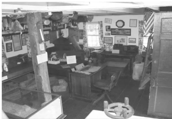
A glimpse inside the old Captain's House