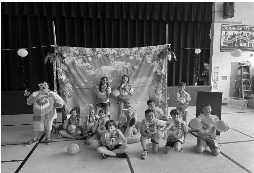
Burnham School Aloha Celebration